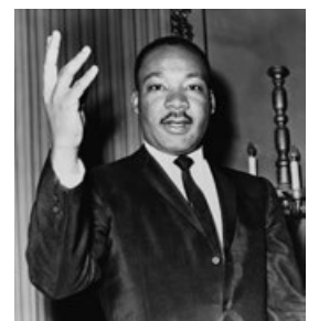
Martin Luther King Jr

Yet this system somehow managed to nurture world-shifting thinkers, including those who launched the Scientific Revolution. This education fostered some of the very habits of mind endorsed by both the National Education Association and the Partnership for 21st Century Learning: critical thinking; clear communication; collaboration; and creativity. (To these '4Cs,' I would add 'curiosity'.) Given that your own education has fallen far short of those laudable goals, I urge you to reconsider Shakespeare's intellectual formation: that is, not what he purportedly thought — about law or love or leadership — but how he thought. An apparently rigid educational system could, paradoxically, induce liberated thinking.