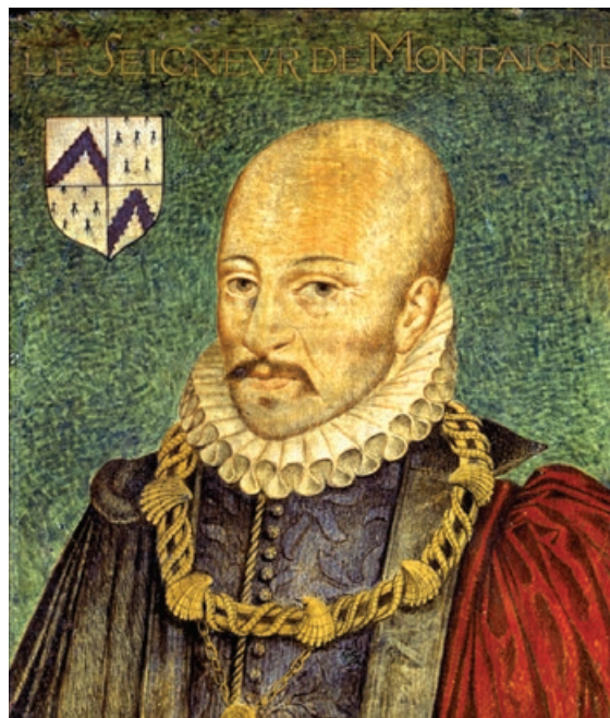
Michel de Montaigne

‘The bees steal from this flower and that, but afterward turn their pilferings into honey, which is their own. ... So the pupil will transform and fuse together the passages that he borrows from others, to make of them something entirely his own; that is to say, his own judgment. His education, his labour, and his study have no other aim but to form this.’